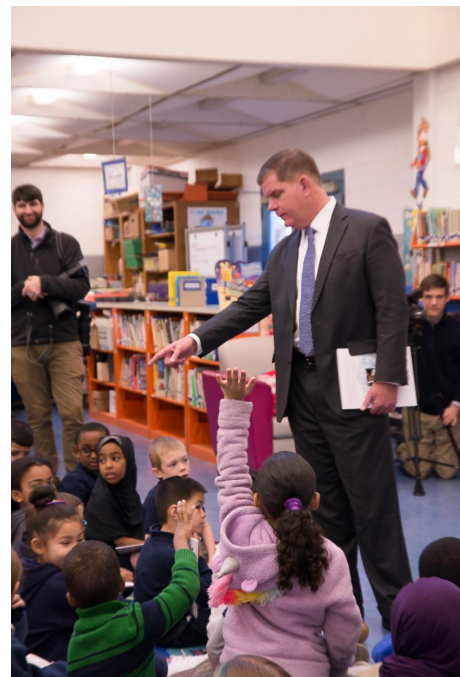
Mayor Marty Walsh reads to Condon Elementary School third graders.