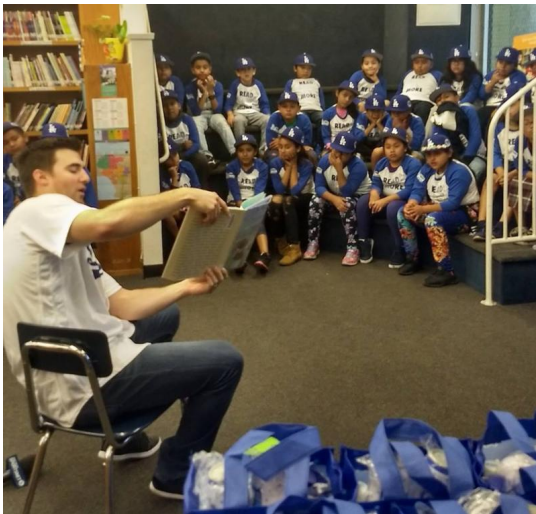
Ross Stripling reading to Read to a Child students