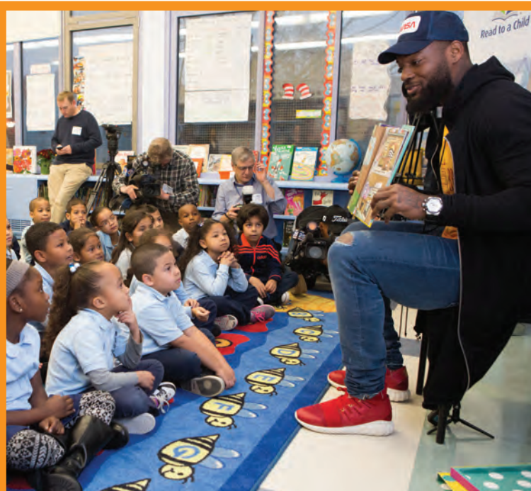
Super Bowl champ and children's book author Martellus Bennett reads to Lunchtime Reading Program students at the Tobin Elementary in Boston.