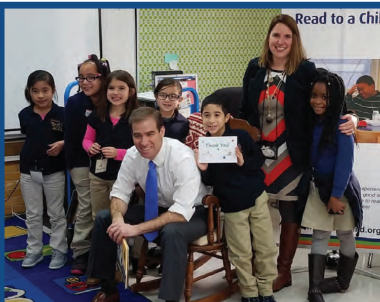
Hartford Mayor Luke Bronin reads to Lunchtime Reading Program students at the Betances Elementary in Hartford.