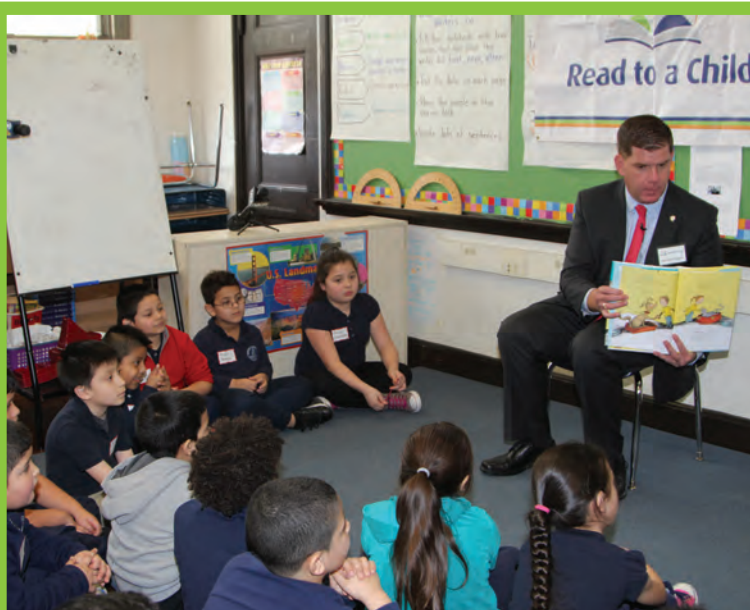
Boston Mayor Marty Walsh reads to Lunchtime Reading Program students at the Adams Elementary in Boston.