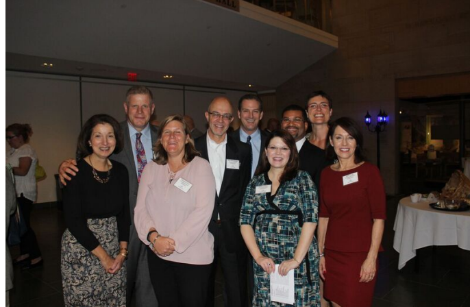
Read to a Child staff and Connecticut regional board members enjoy a great fundraiser at the Mark Twain House.

Read to a Child in Connecticut was delighted to welcome nearly 100 supporters of the Lunchtime Reading Program to its Second Annual Fundraiser on October 19th at the Mark Twain House in Hartford. The evening featured tours of the historic house, a silent auction, and an opportunity to celebrate the program's important role in building literacy skills in at-risk students in Hartford, New Britain, and New Haven.