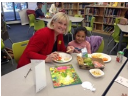
A reading mentor and her buddy at Leo Politi Elementary School.

Thanks to our dedicated volunteers, students at our Lunchtime Reading Program are treated to weekly read-aloud sessions designed to enhance their self-confidence and instill a love of reading. Our school partners value the individualized attention their students receive with their reading mentors.