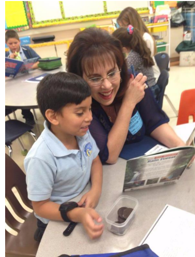
A reading mentor and her buddy at the Coral Way K-8 school.

A huge thank you to all those who responded to the call for support on this very special day for nonprofits in Miami!